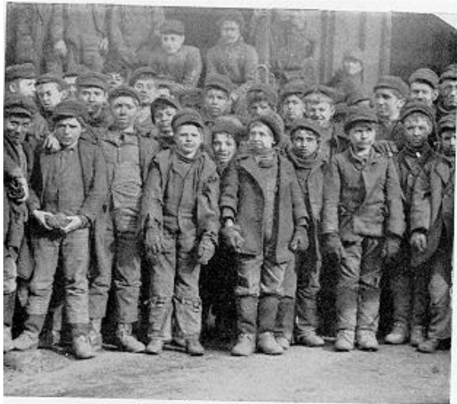
Pennsylvania Breaker Boys.