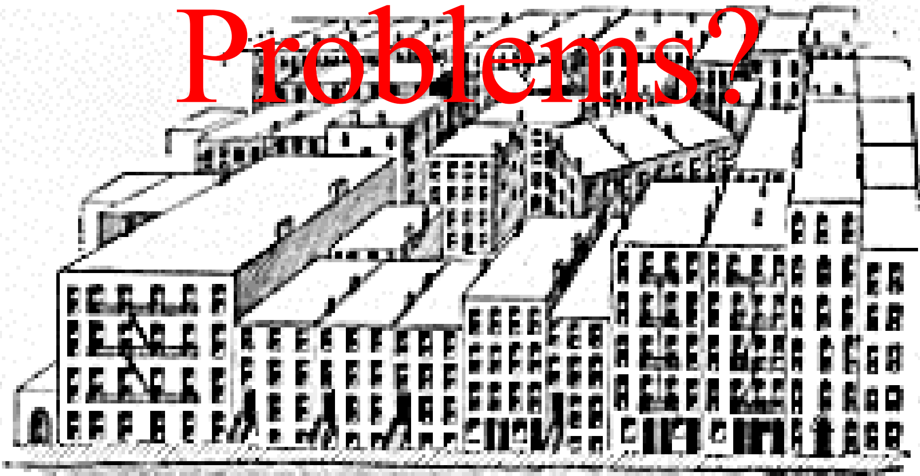
BIRD'S EYE VIEW OF AN EAST SIDE TENEMENT BLOCK. (FROM A DRAWING BY CHARLES F. WINGATE, ESQ.)