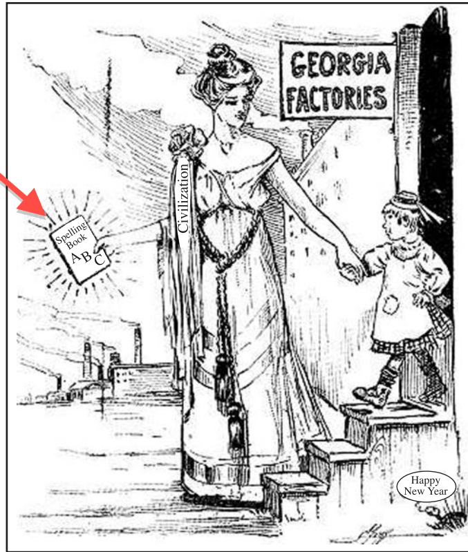
The State of Georgia welcomes the operation of the new Child Labor Law.

Source: L. C. Gregg, Atlanta Constitution , 1907 (adapted)